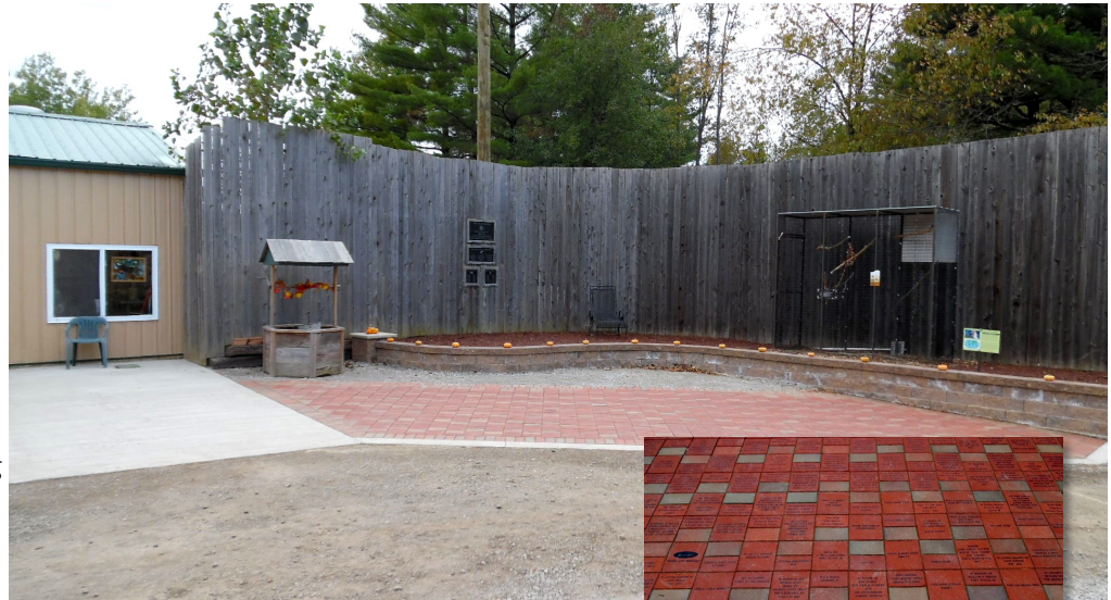
New patio features engraved donor bricks!

This project has been a long time coming, but we hope you agree the results are worth the wait!