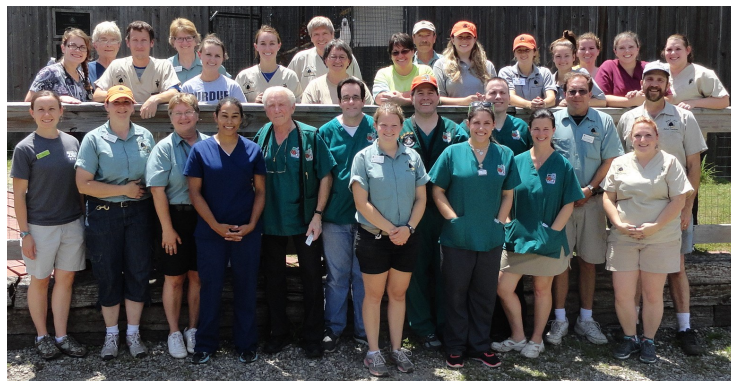
To learn more, or donate, visit www.peteremilyfoundation.org .

We are beyond grateful for the amazing charitable gifts and talents of this non-profit Foundation and hope to host another mission here in 2015. We thank them all!